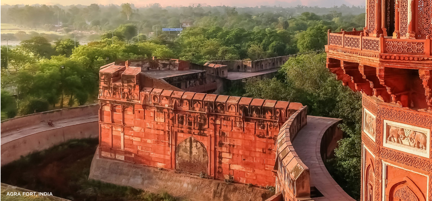
AGRA FORT, INDIA

105 NIGHTS ♦ JANUARY 5 - APRIL 20, 2024 ♦ MIAMI TO ROME 89 NIGHTS ♦ JANUARY 21 - APRIL 20, 2024 ♦ LOS ANGELES TO ROME