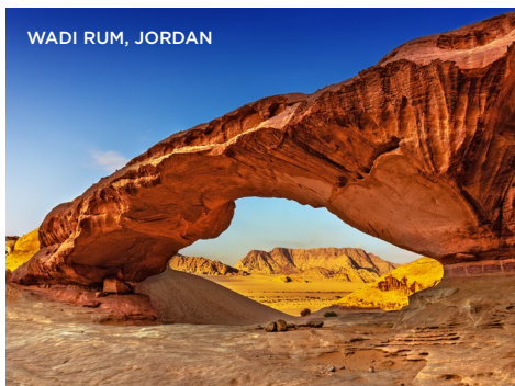
WADI RUM, JORDAN

Focus your wanderlust on the destinations of your dreams and create your own World Cruise itinerary, combining two or more of seven unique segments, each shining a spotlight on a particular part of the world. Fall in love with the romance of Fiji, Tahiti and South Pacific isles long revered as the inspiration for artists and authors. Navigate New Zealand's Dusky, Doubtful and Milford sounds, and then retreat to the sprawling wine country. Discover Melbourne's trendy culinary scene and Sydney's iconic opera house and harbor. Explore the treasures of Indonesia, from Bali to Komodo, and witness the world in motion, from the temples of India to the skyscrapers of Malaysia. On journeys where ancient traditions and modern masterpieces coexist side-by-side, travel the road of sultans and kings throughout Israel and Jordan to arrive in Italy, itself a masterpiece of art, culture and wonder.